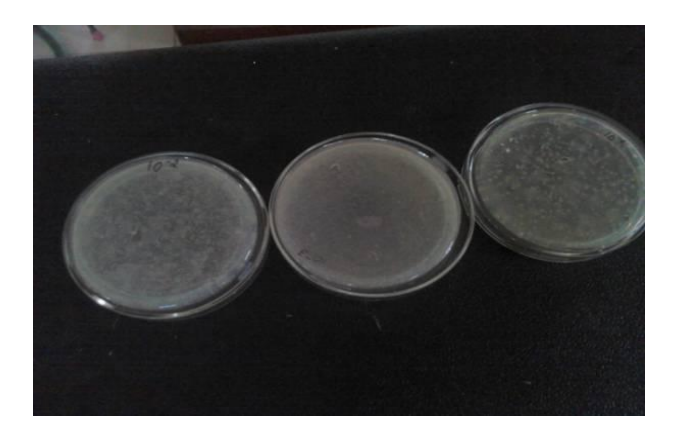
Figure.1 Isolation of Organisms from Soil and Waste Water